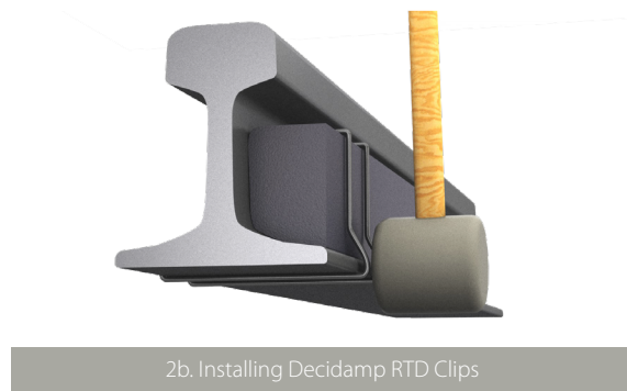
2b. Installing Decidamp RTD Clips