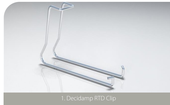
1. Decidamp RTD Clip

Please contact Pyrotek® for further information or detailed advice on your specific application.