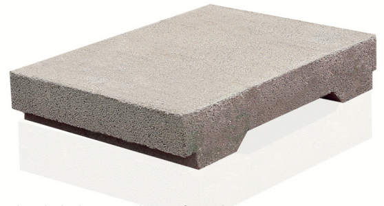
Rail track tile design made out of Viterolite® 900

This Installation Guide provides recommendations to maximise the service life in outdoor applications. Viterolite® 900 should always be installed over surfaces that are flat, clean, free of contaminants and with adequate drainage.