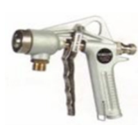
GNG/T3005 Texture Gun Bottom Entry