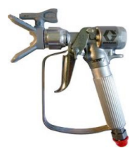
XTR-7 Airless Spray Gun