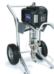
GRACO XTREME 70:1 PNEUMATIC PUMP