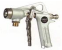
GNG/T3005 Texture Gun Bottom Entry