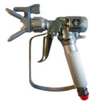
XTR-7 Airless Spray Gun