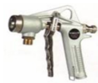
GNG/T3005 Texture Gun Bottom Entry